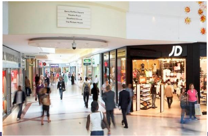
Generic image of mall