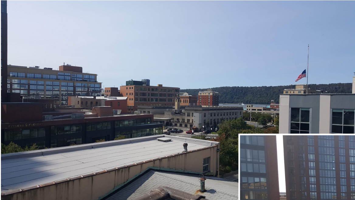
ROOF VIEW FACING RIVER