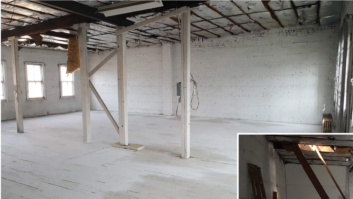
THIRD FLOOR INTERIOR