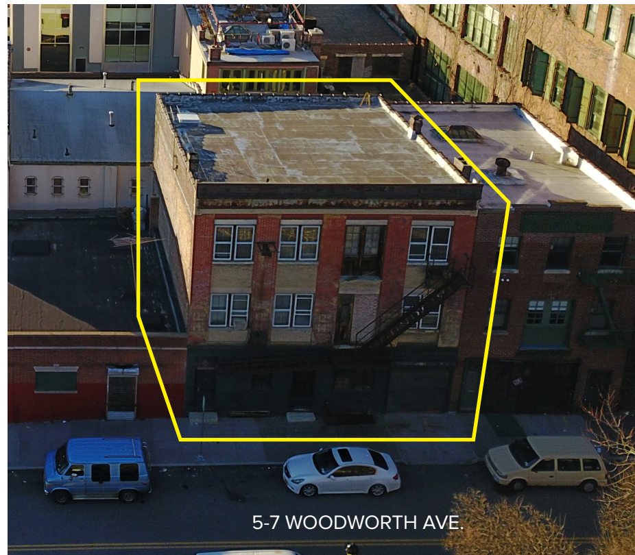
5-7 WOODWORTH AVE.