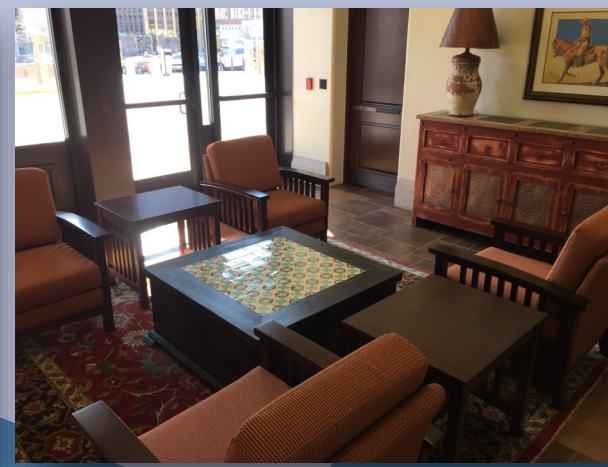
Community Conference Room Lobby