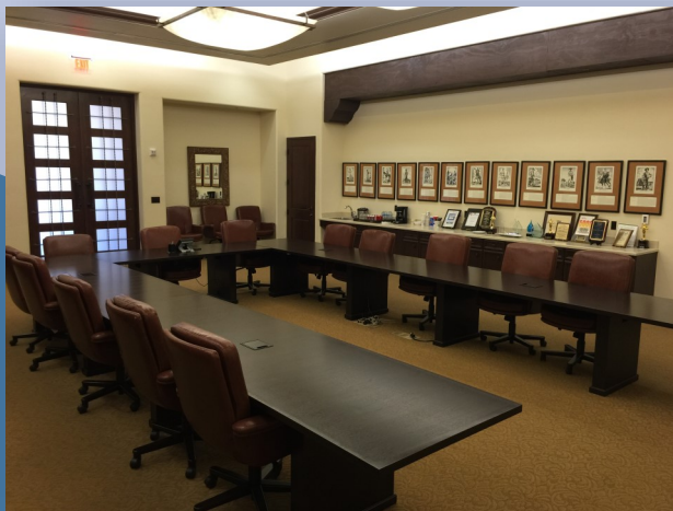
Community Conference Room