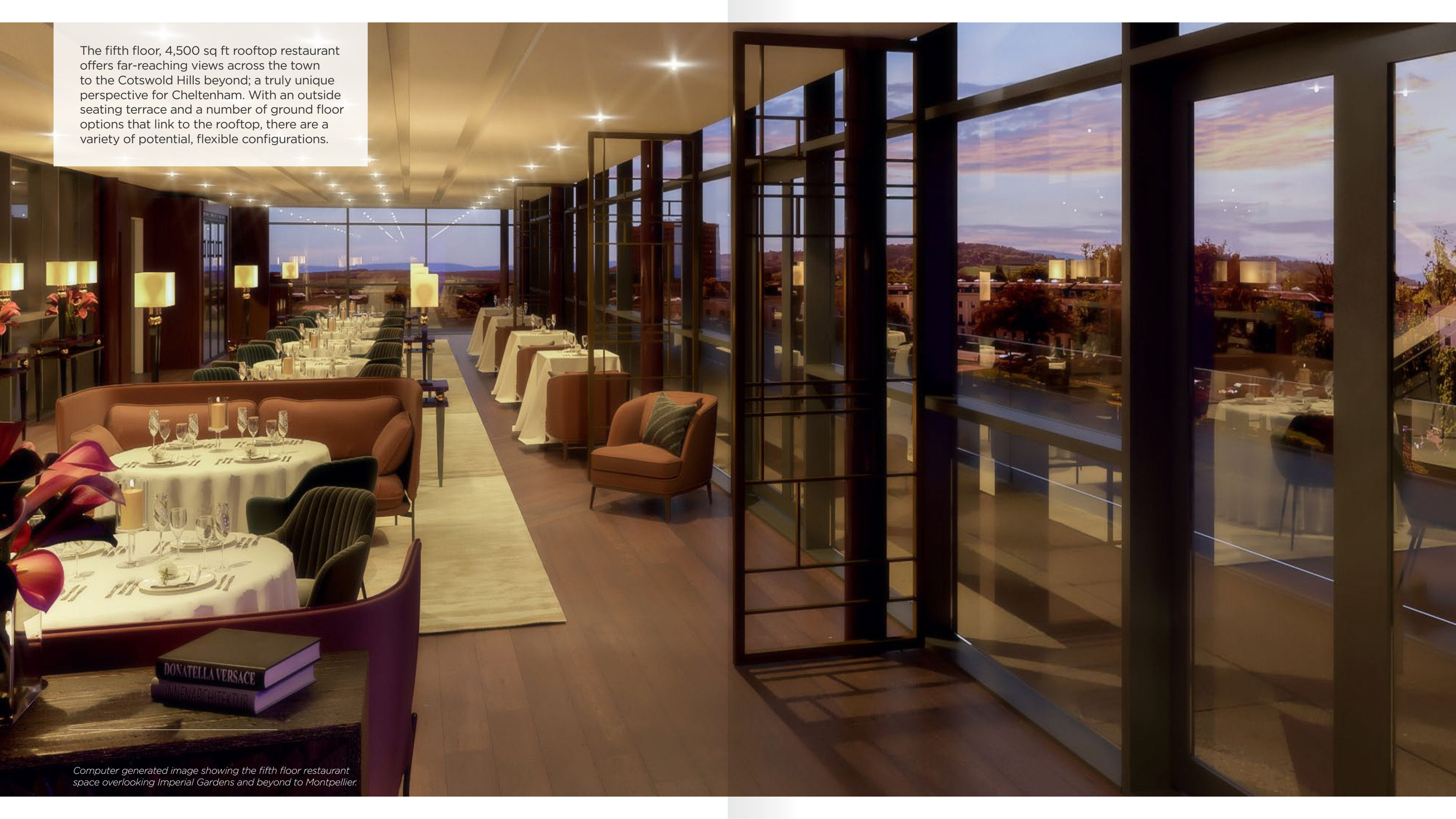
Computer generated image showing the fifth floor restaurant space overlooking Imperial Gardens and beyond to Montpellier.

The fifth floor, 4,500 sq ft rooftop restaurant offers far-reaching views across the town to the Cotswold Hills beyond; a truly unique perspective for Cheltenham. With an outside seating terrace and a number of ground floor options that link to the rooftop, there are a variety of potential, flexible configurations.