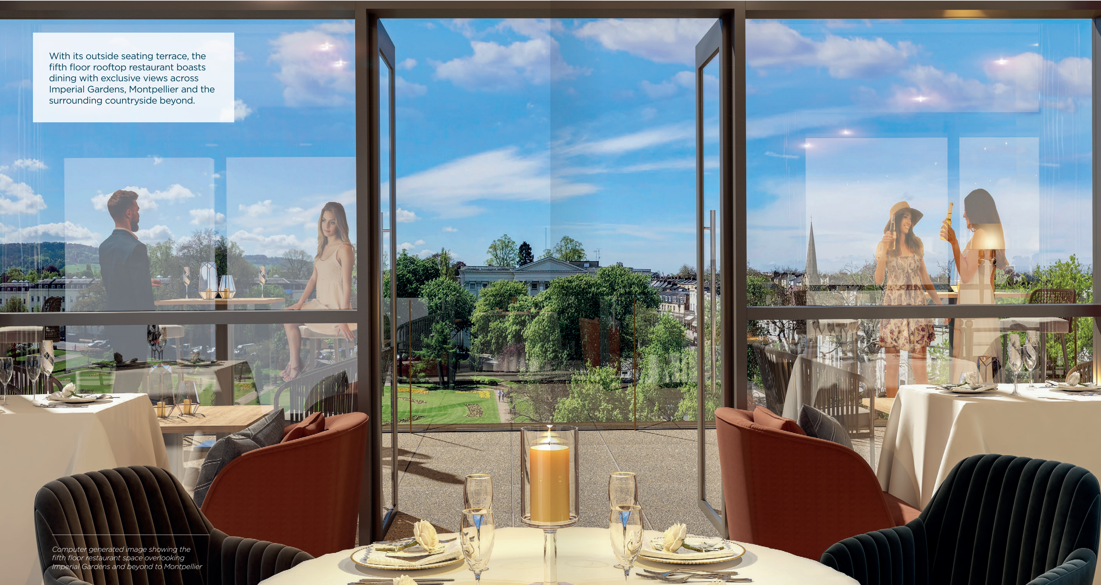
Computer generated image showing the fifth floor restaurant space overlooking Imperial Gardens and beyond to Montpellier

With its outside seating terrace, the fifth floor rooftop restaurant boasts dining with exclusive views across Imperial Gardens, Montpellier and the surrounding countryside beyond.