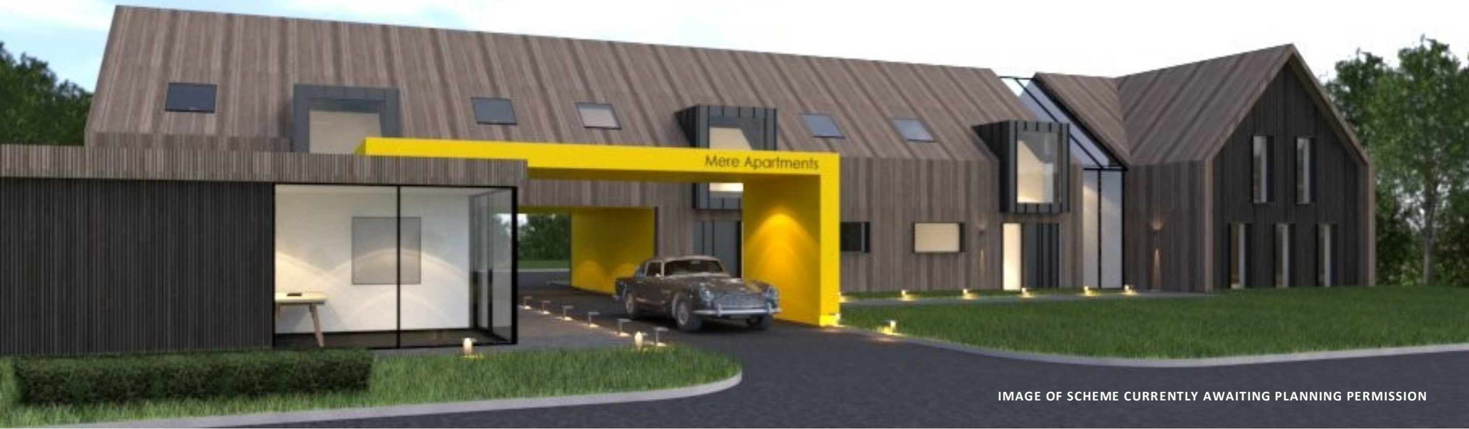
IMAGE OF SCHEME CURRENTLY AWAITING PLANNING PERMISSION

FORMER SERVICE STATION | CHESTER ROAD | KNUTSFORD | WA16 0PP