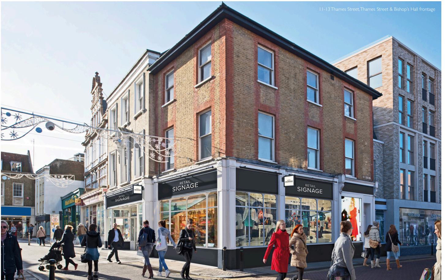
11-13 Thames Street From Market Square