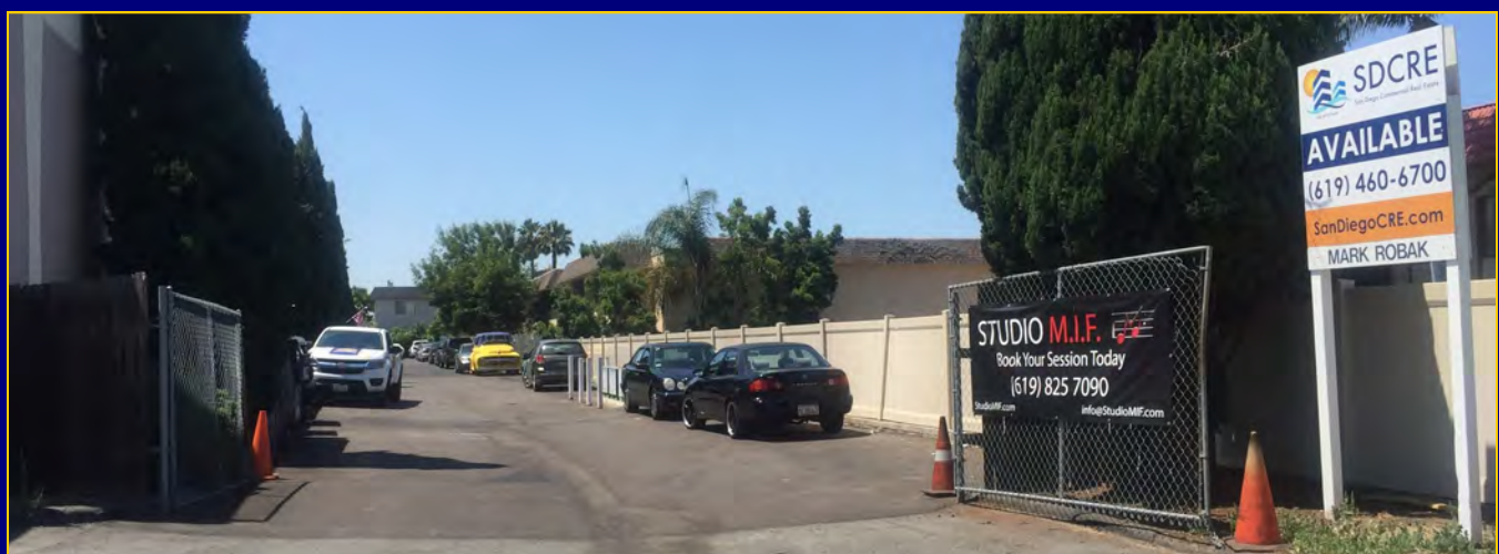
Entrance from El Cajon Blvd.