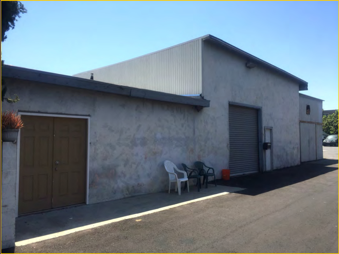
Front of Suite