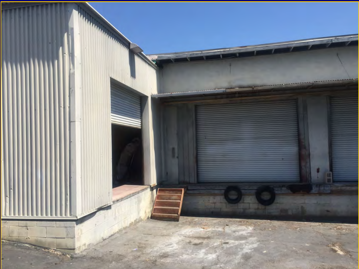
Rear Dock-Hi Doors