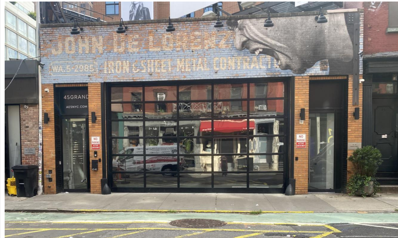
VIEW FROM GRAND ST