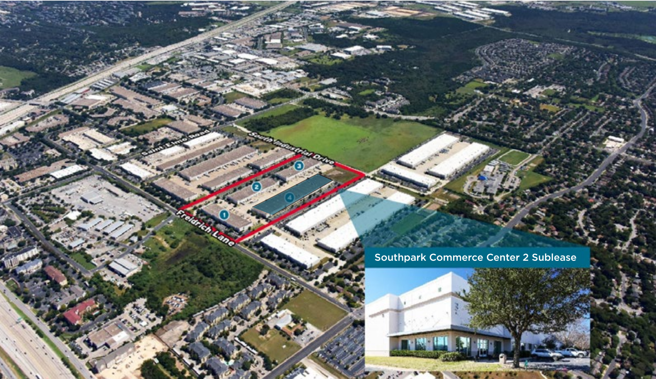
Southpark Commerce Center 2 Sublease