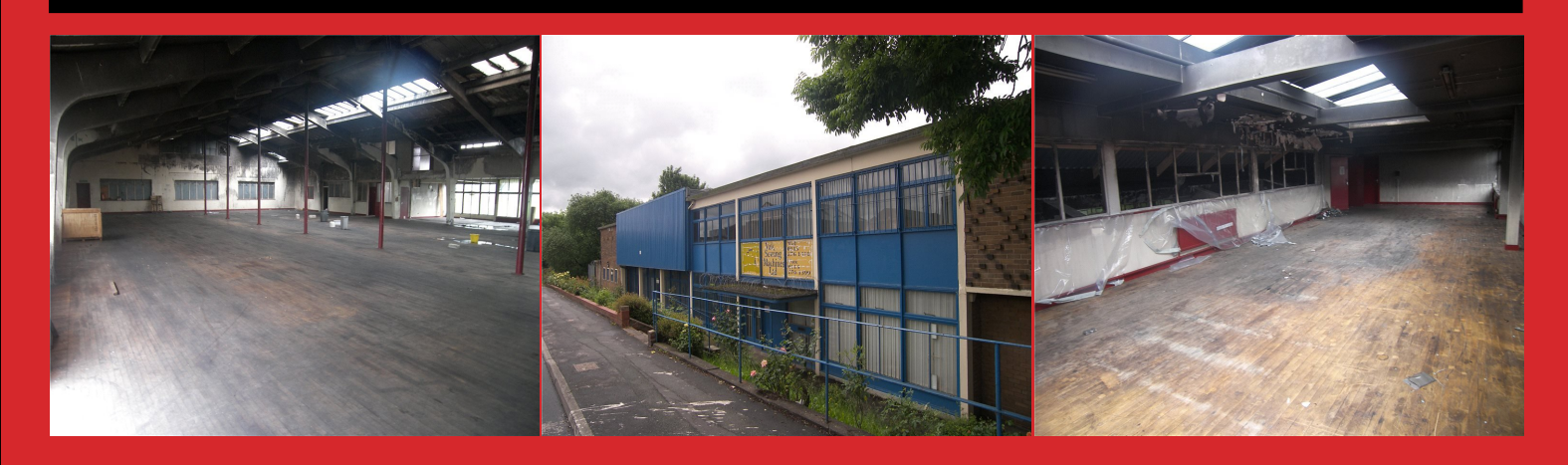
For Sale by auction on Wednesday 13th July 2016