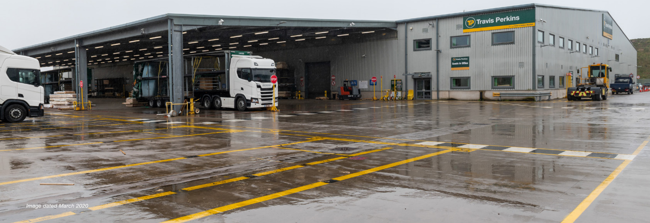
Image dated March 2020