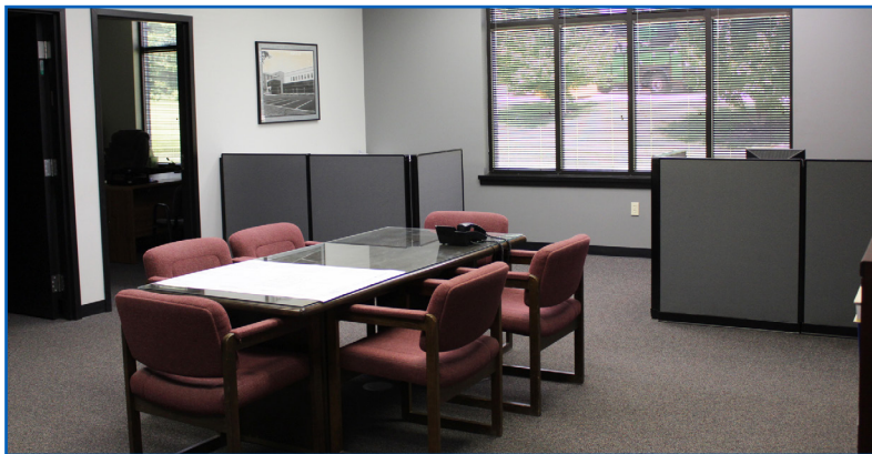
OPEN OFFICE FLOOR PLAN