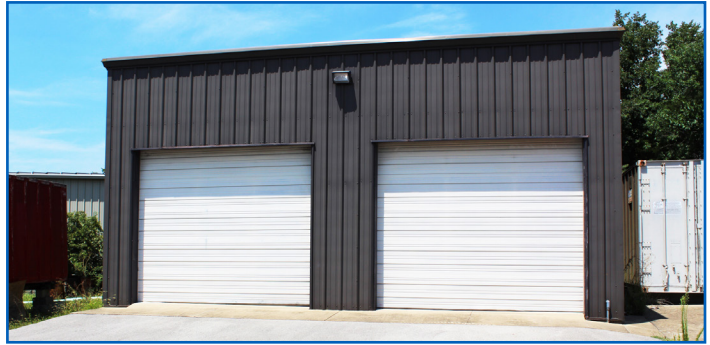
UTILITY BUILDING (DETACHED)