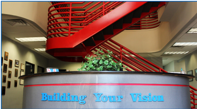
TWO-STORY OFFICE / MEZZANINE