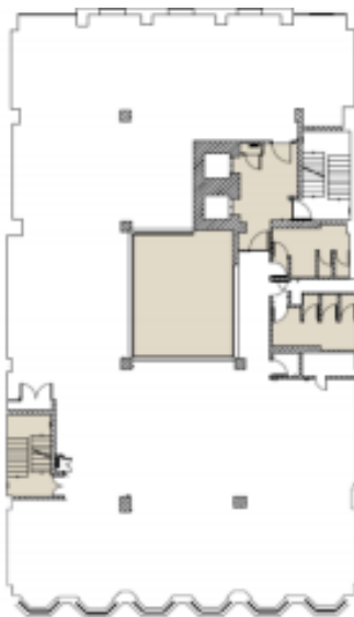
Typical Upper Floor