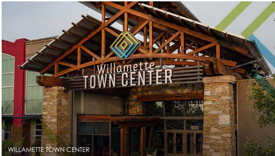
WILLAMETTE TOWN CENTER