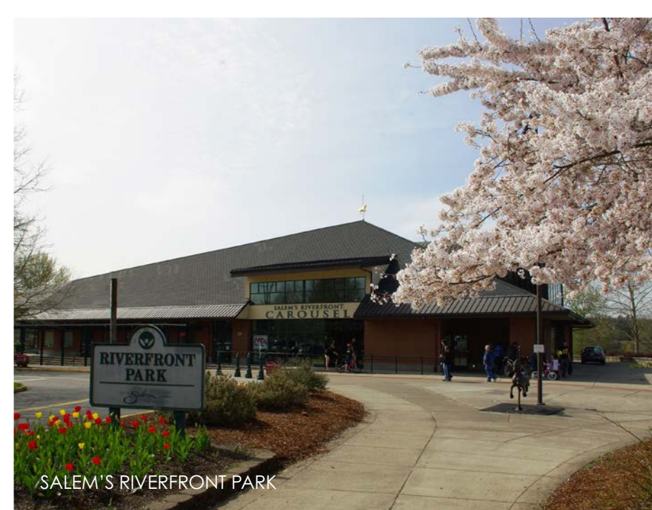
SALEM'S RIVERFRONT PARK

Salem, Oregon, the state capital and third-largest city in the state, is located in the heart of the fertile Willamette Valley about an hour's drive south of Portland. Known for its historic downtown, government institutions, and agricultural heritage, Salem serves as both a political and economic hub for the region. Its central location provides access to statewide commerce while maintaining a balance of urban amenities and small-city character. The city benefits from major employers in government, healthcare, higher education, and food processing, with leading institutions such as Salem Health, Willamette University, and the State of Oregon anchoring the local economy.