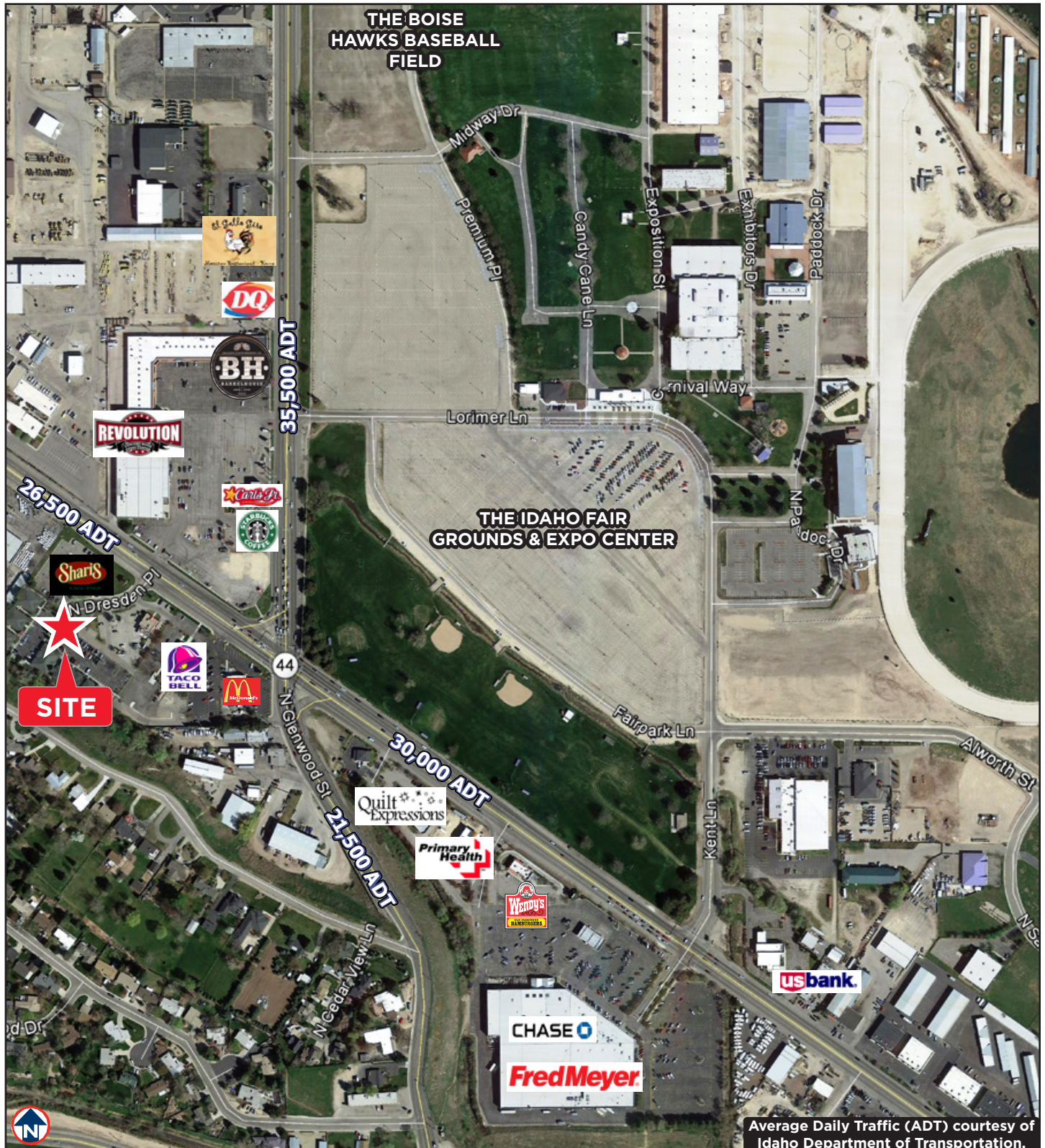
Average Daily Traffic (ADT) courtesy of Idaho Department of Transportation.

4491 North Dresden Place, Garden City, Idaho 83714