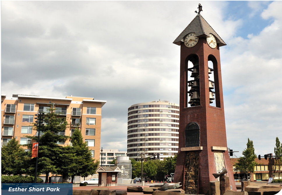
Esther Short Park