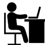
3 PRIVATE OFFICES AND BULL PEN