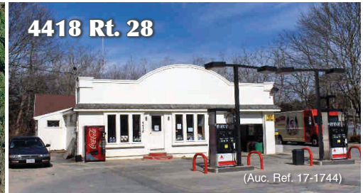
4418 Rt. 28