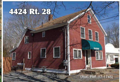
4424 Rt. 28

To be Offered Individually & in the Entirety