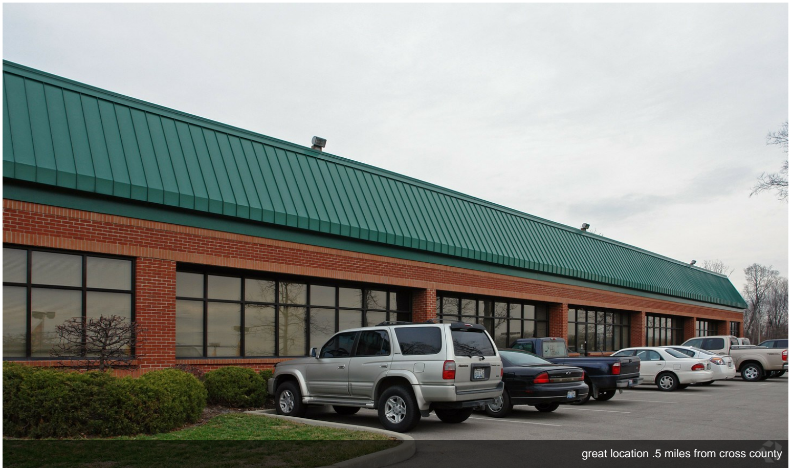
great location .5 miles from cross county