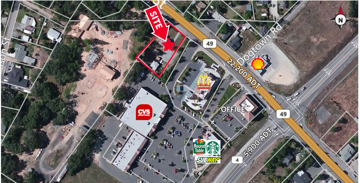
ALTAVILLE TOWNSITE BLK 4 FOR LOTS 1,2,3