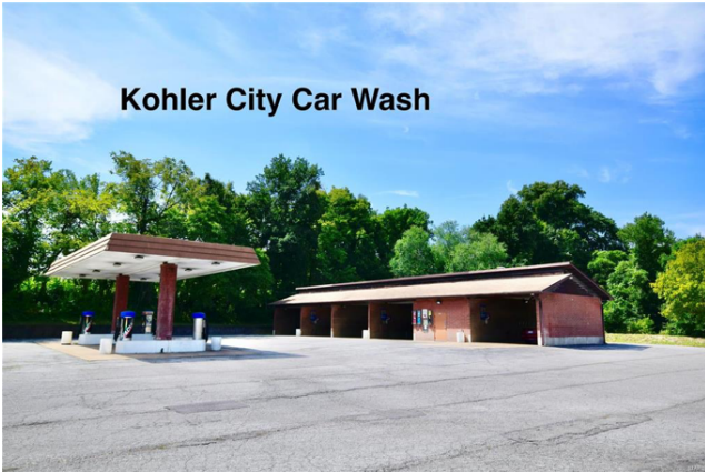
Kohler City Car Wash

L Price: $275,000 O Price: $275,000 L Date: 09/03/2021