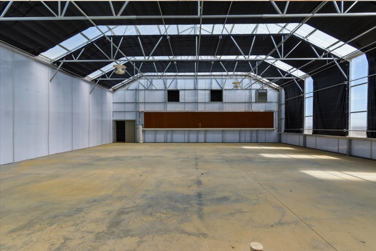
7950 Maverick Lane, Ordway, CO 81063—PW CO CANRE GRAIL, LLC