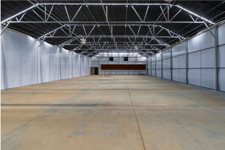
Ajax Realty Group 7