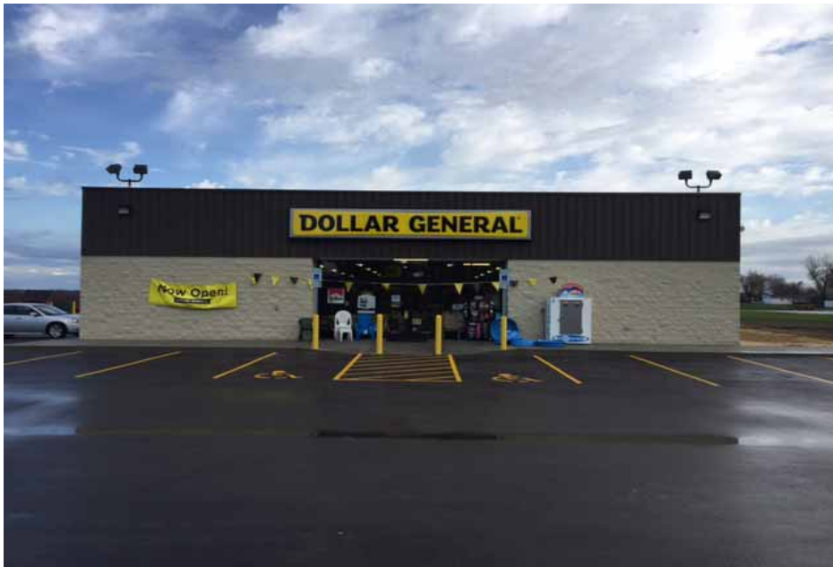
New prototype Dollar General Store, picture is of the Hamel, IL store.

ADDRESS: 484 N. Main Street, Seneca, IL 61360