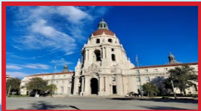
PASADENA CITY HALL