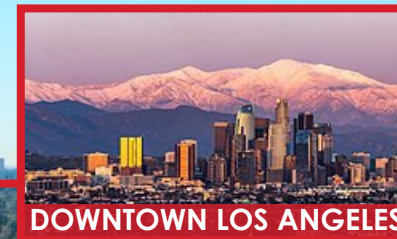
DOWNTOWN LOS ANGELES