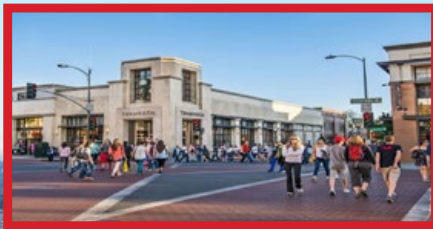
OLD TOWN PASADENA