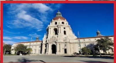
PASADENA CITY HALL