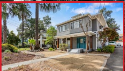
405 & 411-417 N EUCLID AVE