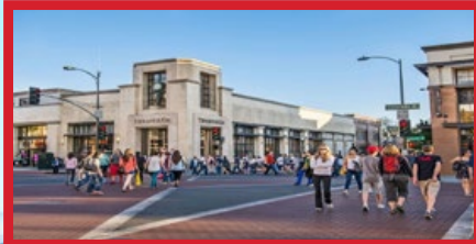
OLD TOWN PASADENA