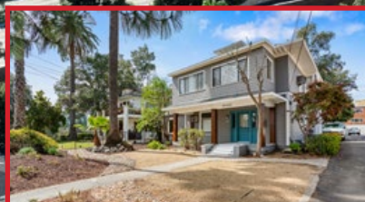
405 & 411-417 N EUCLID AVE