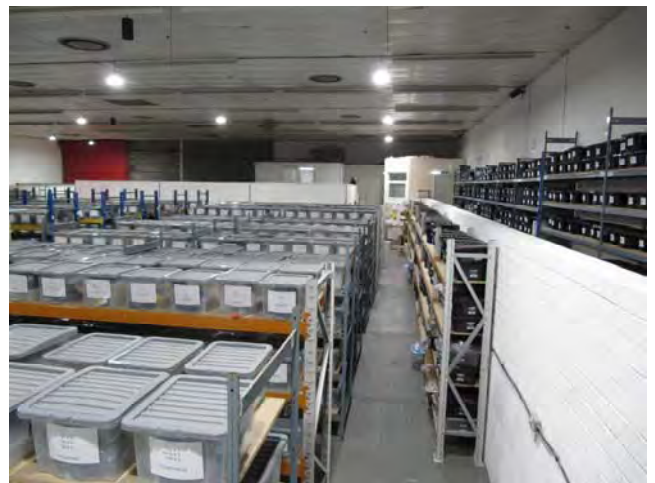
Particulars & Images - November 2017