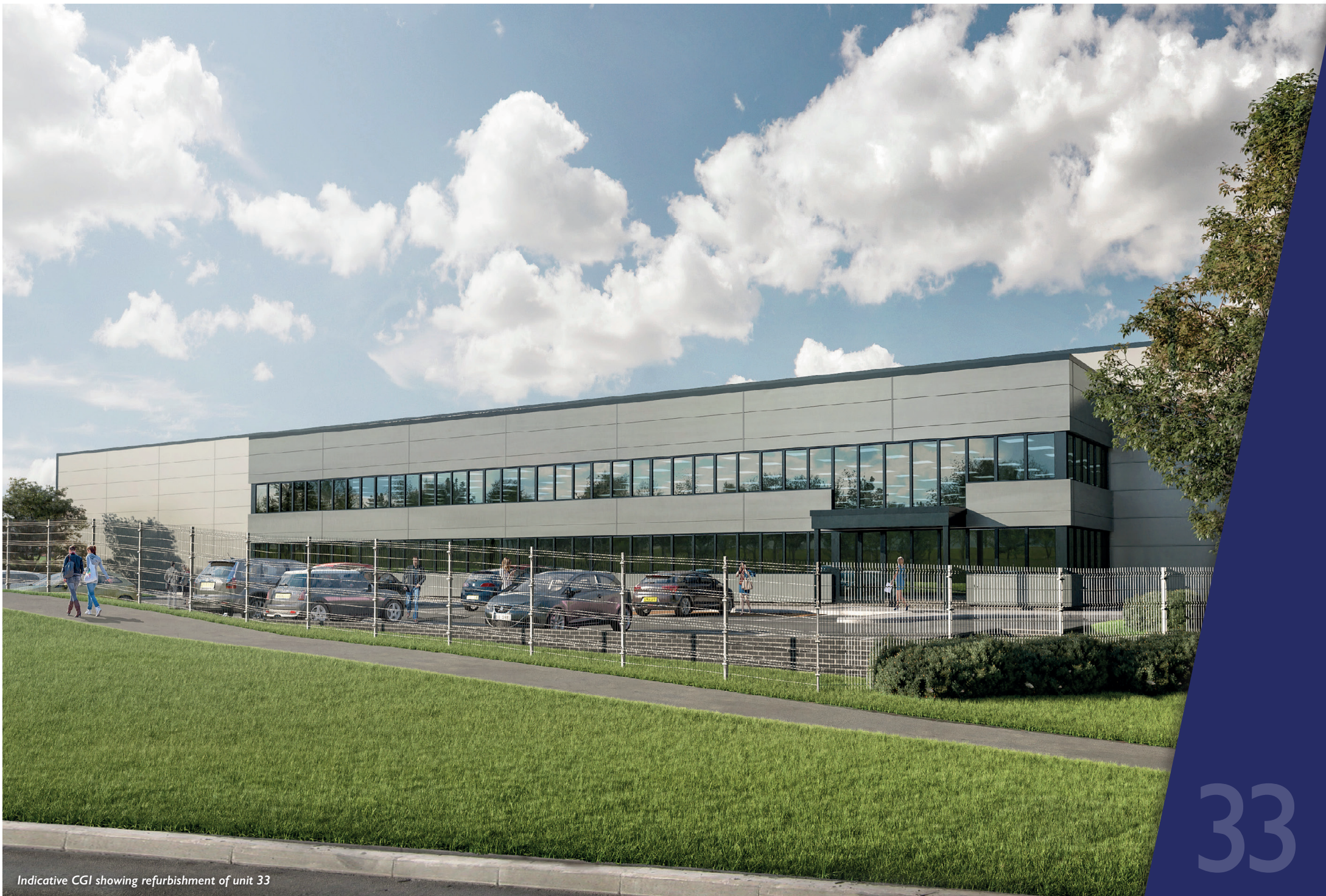
Indicative CGI showing refurbishment of unit 33