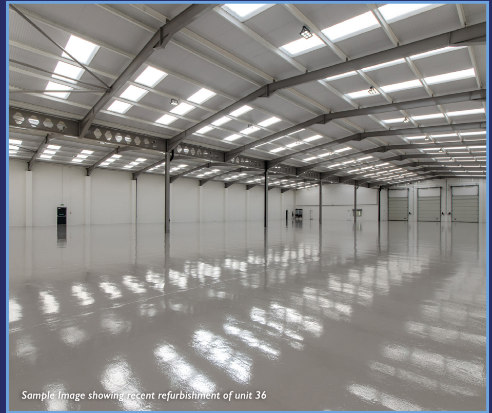
Sample Image showing recent refurbishment of unit 36