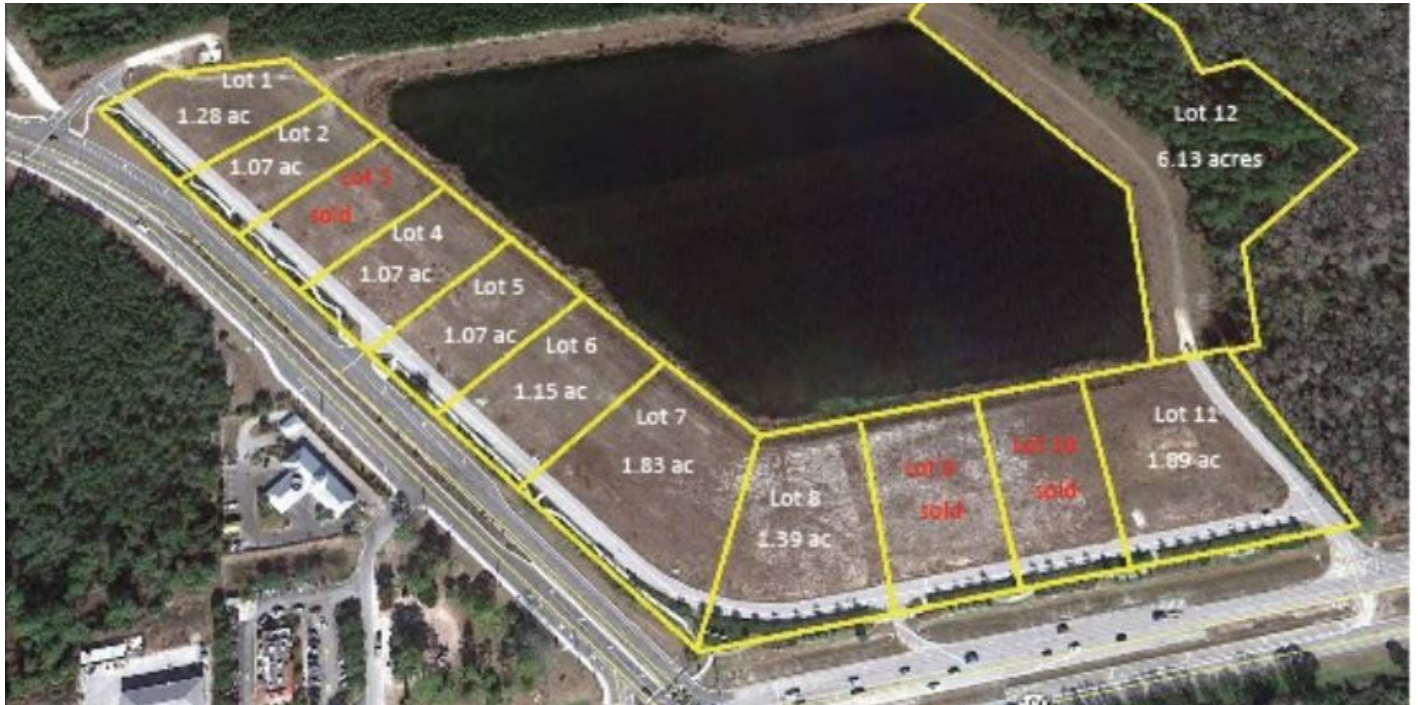
Kings Point Palm Coast, Florida 32137

For Sale Commercial Sites Palm Coast, Florida 32137