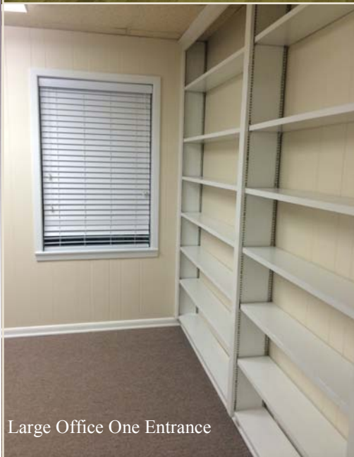
Large Office One Entrance