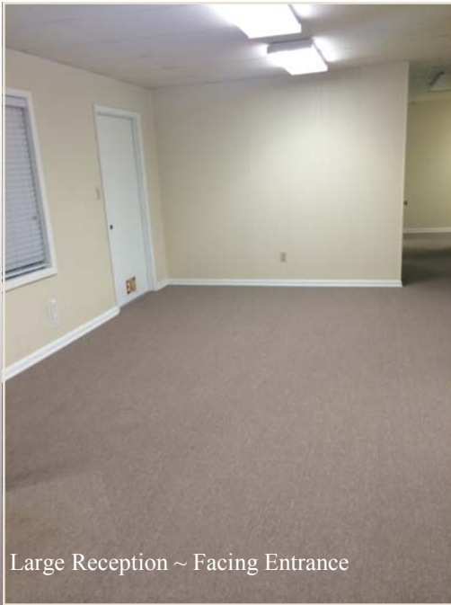
Large Reception ~ Facing Entrance