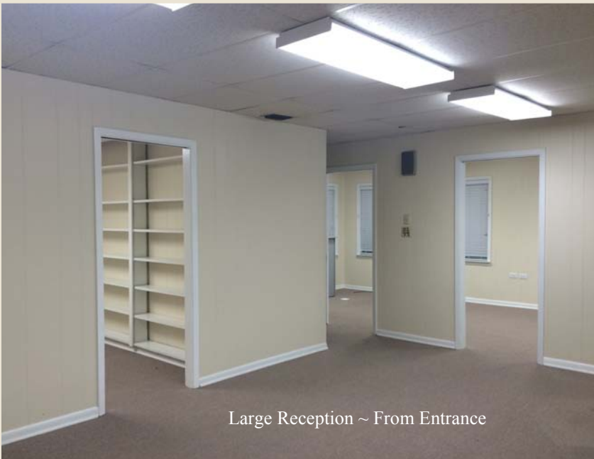
Large Reception ~ From Entrance