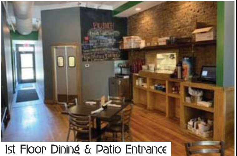
1st Floor Dining & Patio Entrance