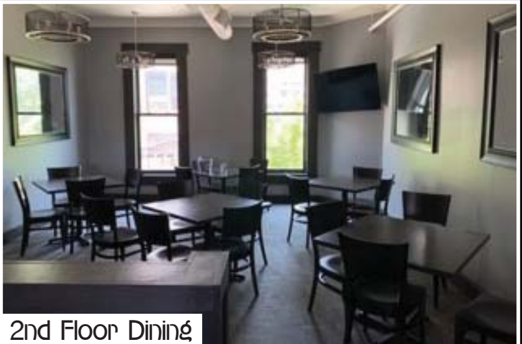
2nd Floor Dining