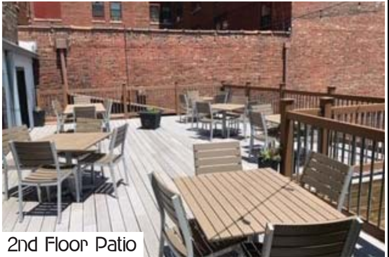
2nd Floor Patio