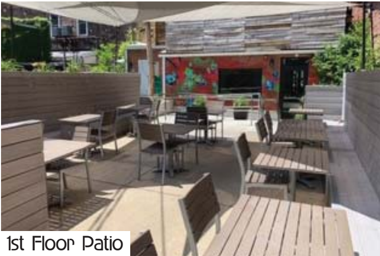
1st Floor Patio