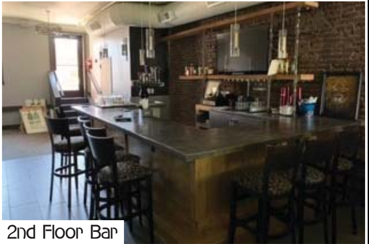
2nd Floor Bar