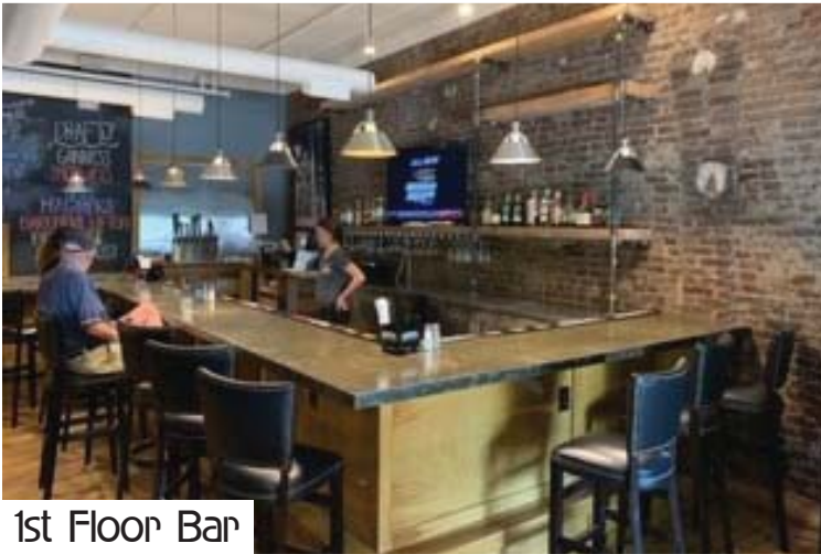
1st Floor Bar