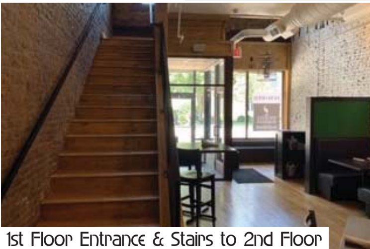
1st Floor Entrance & Stairs to 2nd Floor