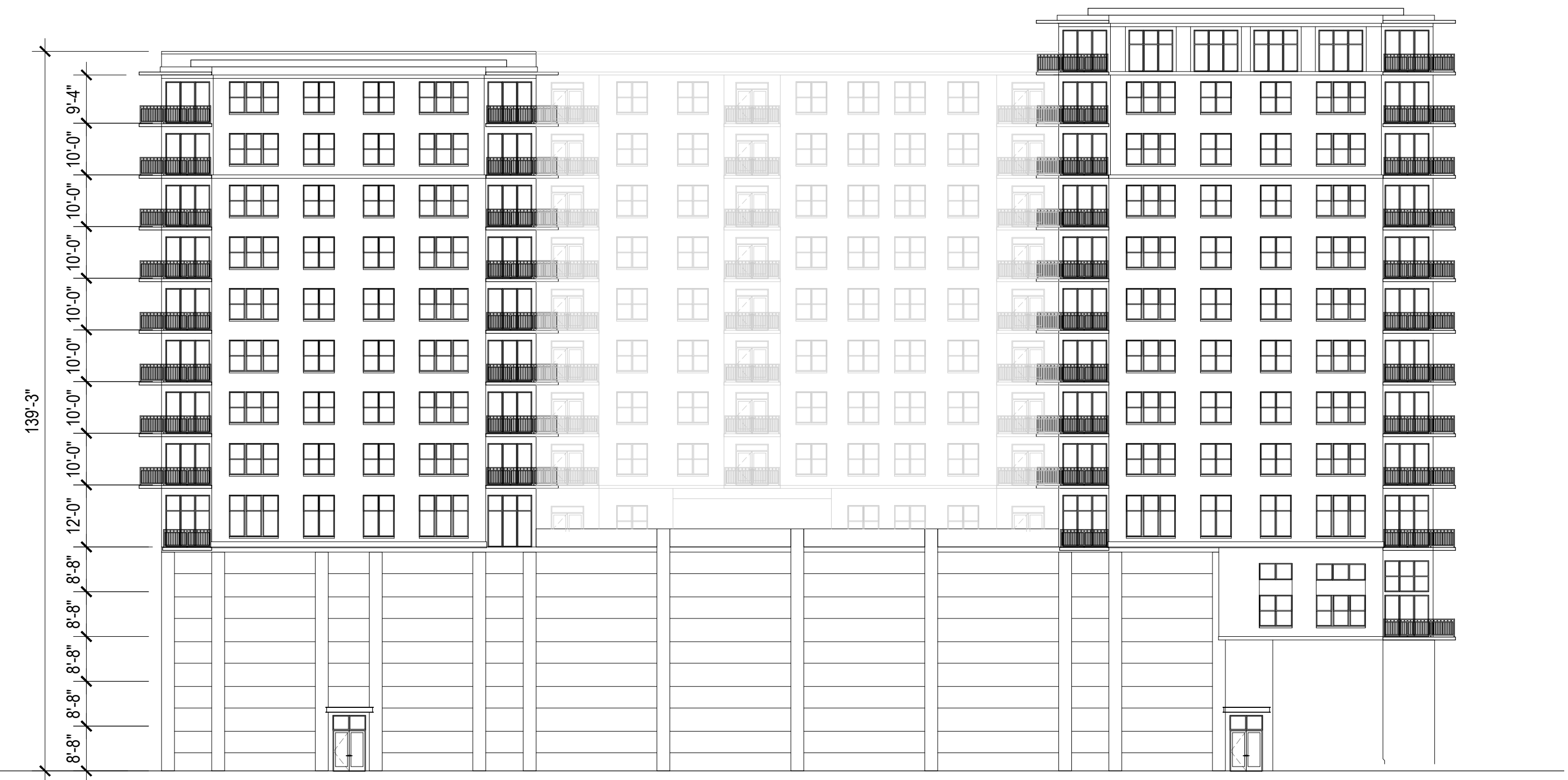
3 NORTH ELEVATION 1" = 20'