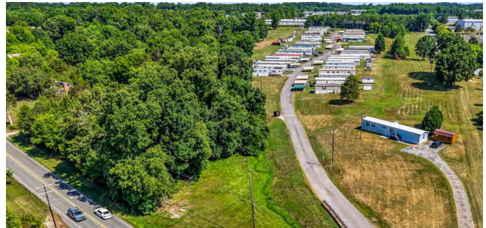
SIDES MOBILE HOME COURT