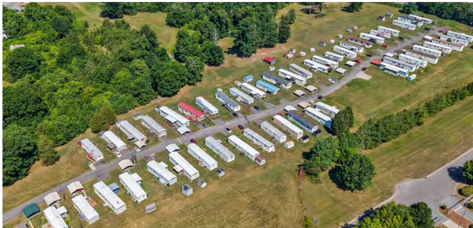
SIDES MOBILE HOME COURT