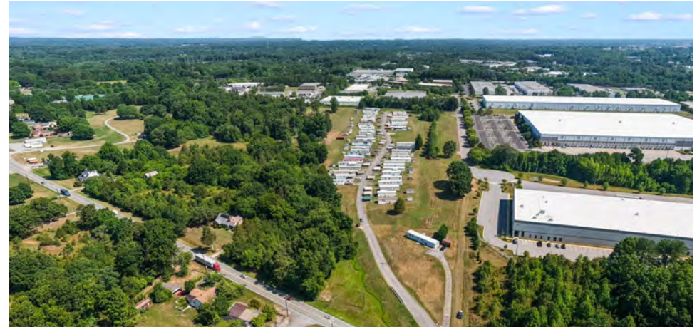
SIDES MOBILE HOME COURT