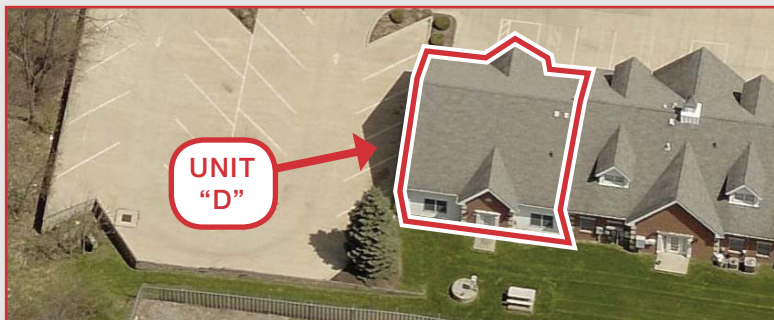
Back Side Entrance Area