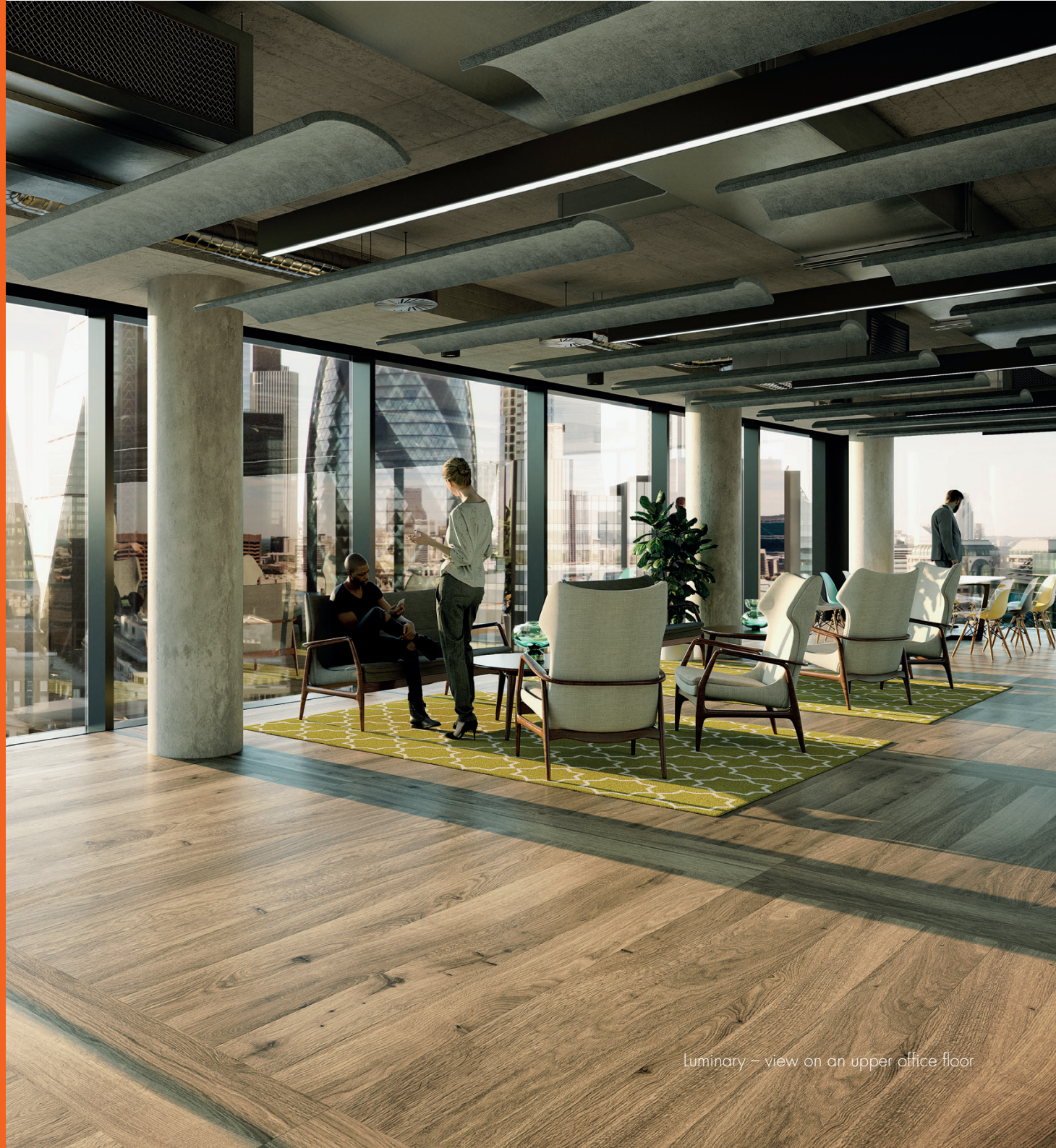
Luminary – view on an upper office floor

MISREPRESENTATION ACT 1967 and PROPERTY MISDESCRIPTIONS ACT 1991 CBRE and their clients give notice that: (i) These particulars do not form part of any offer or contract and must not be relied upon as statements or representations of fact. (ii) No person in the employment of the agent(s) has any authority to make or give any representation or warranty whatever in relation to this property. (iii) Floor areas, measurements or distances given are approximate. Unless otherwise stated, any rents, or outgoings quoted are exclusive of VAT. (iv) Any descriptions given of the property cannot be taken to imply, it is in good repair, has all necessary consents, is free of contamination, or that the services and facilities are in working order. Interested parties are advised to carry out their own investigations as required. December 2018.