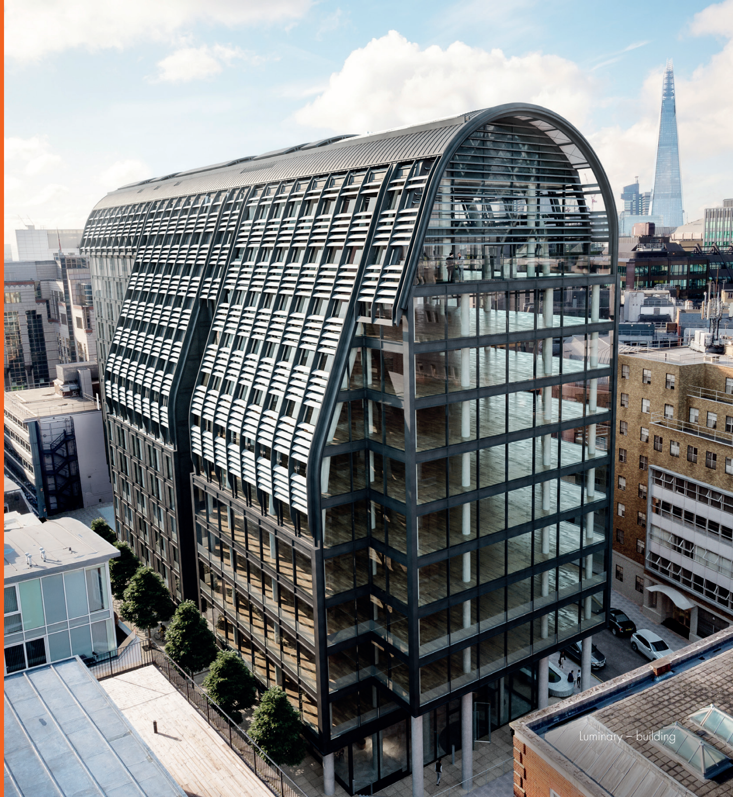
Luminary – building