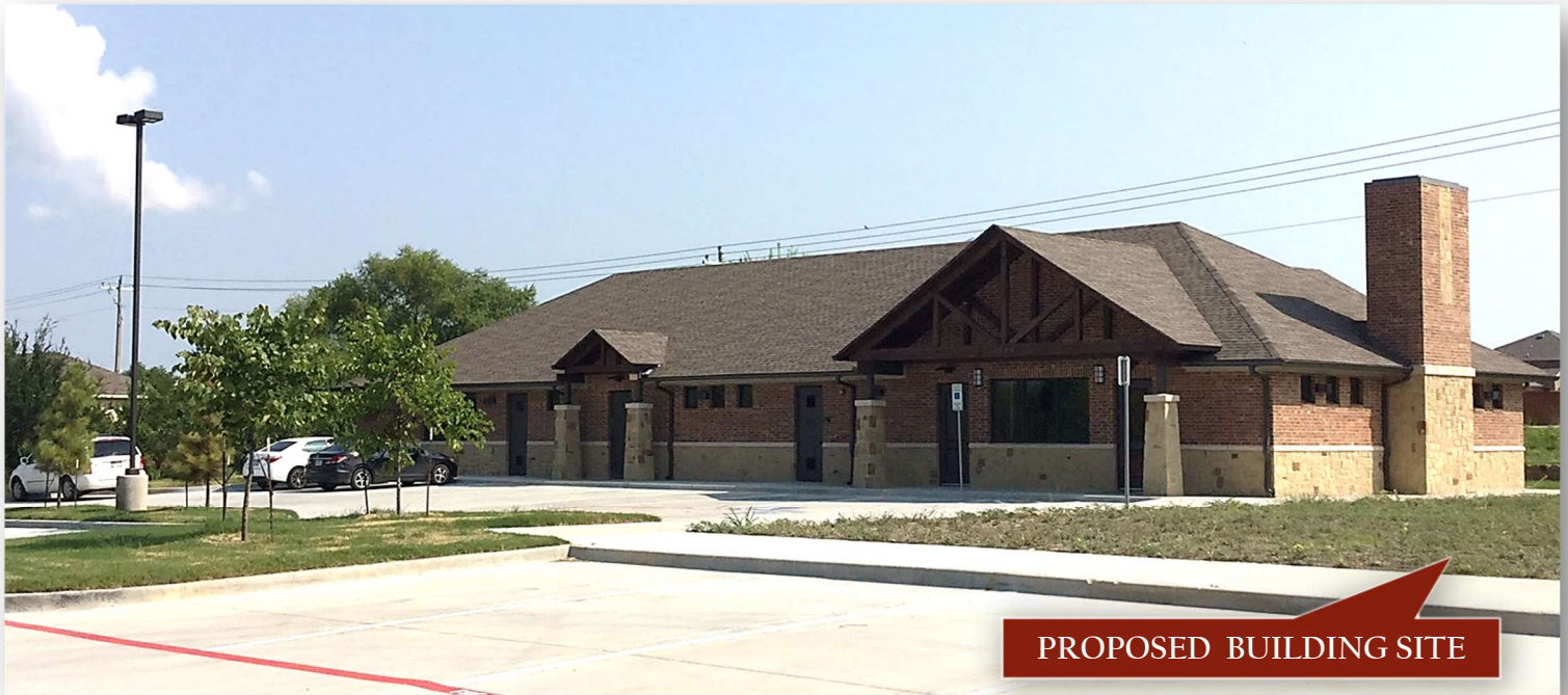
PROPOSED BUILDING SITE