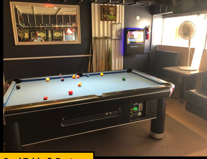
Booth Seating With Pool Table & Darts