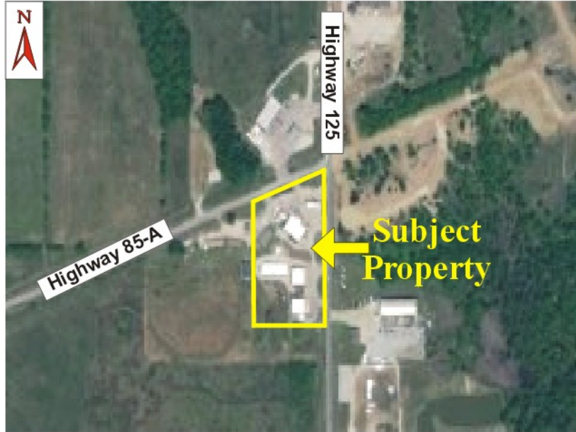
Aerial View Of Property