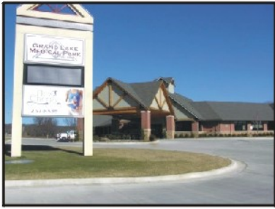
New Medical Center located across Highway 85-A