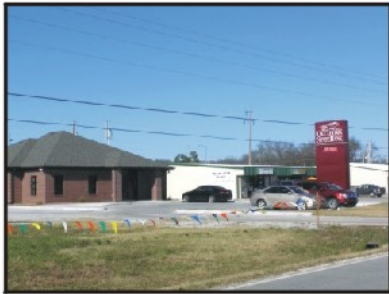
Bank next door