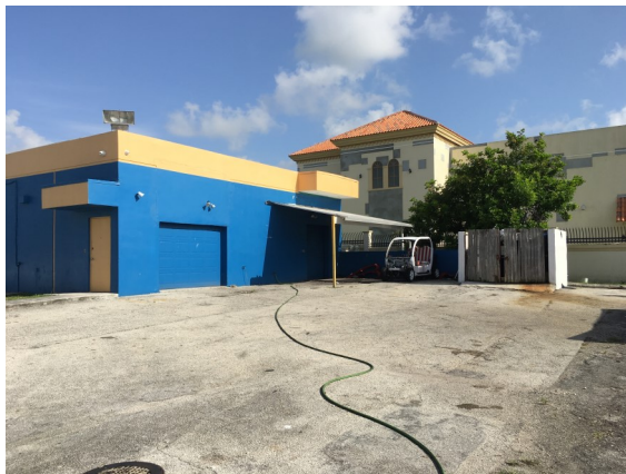
Rear Detail Area