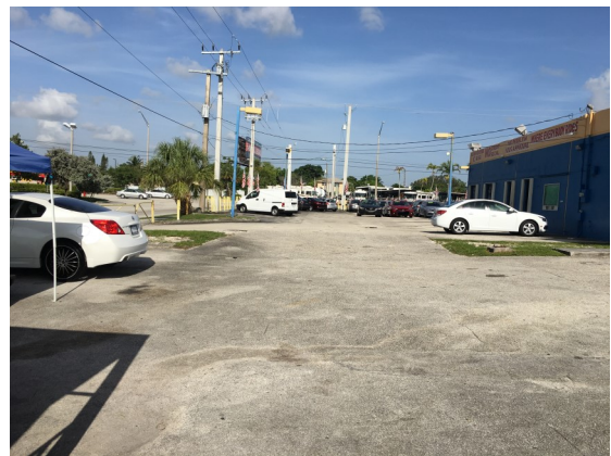
Lot looking toward St. Rd. 7