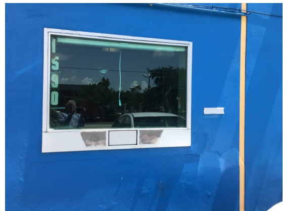
Outside Payment Window

No warranty or representation, expressed or implied, is made as to the accuracy of the information contained herein, and same is submitted subject to errors, omissions, change of price, rental or other conditions, withdrawal without notice, and to any special conditions imposed by our principals.