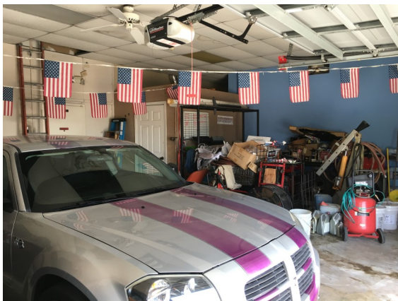
Inside Repair Bay