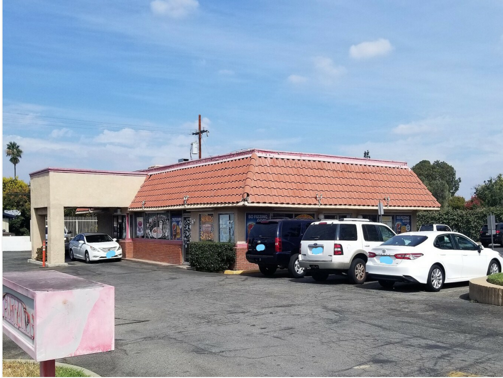
Building West Side_LI