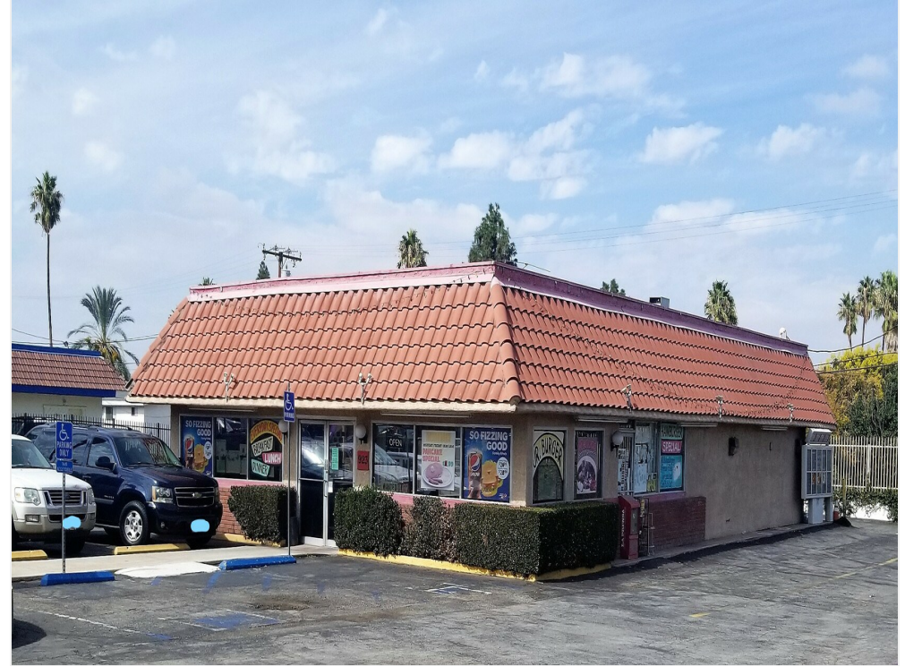
Building East Side_LI