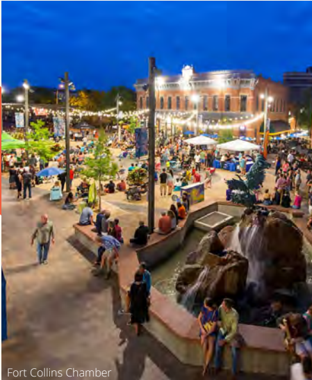
Fort Collins Chamber