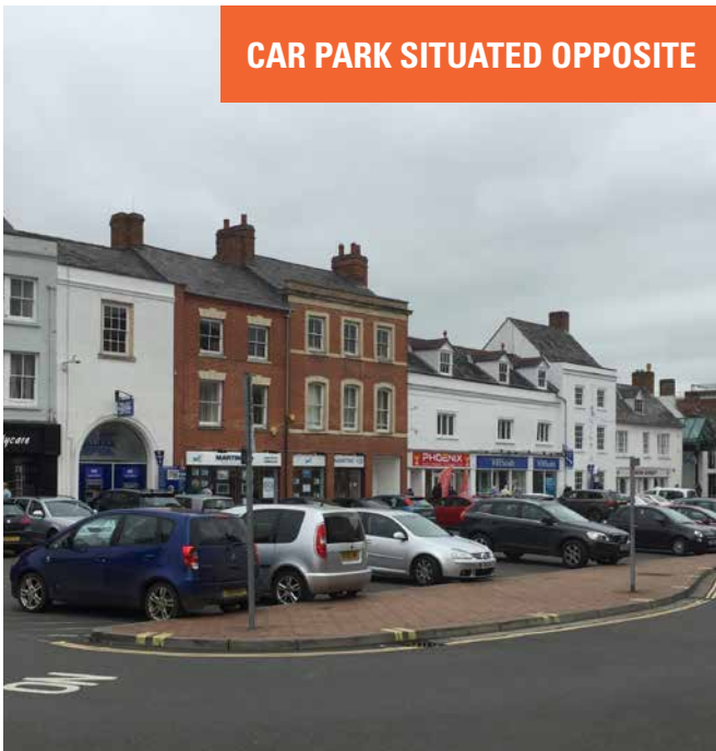
CAR PARK SITUATED OPPOSITE