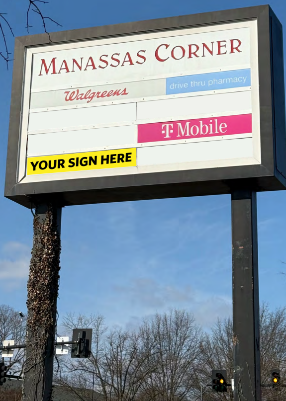
SUDLEY ROAD PYLON