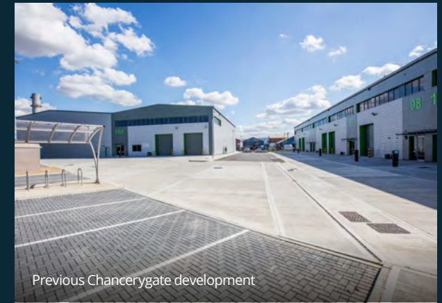
Previous Chancerygate development

Units are available freehold or to let on new terms to be agreed.