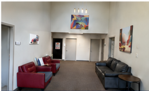
Common Area / Lobby