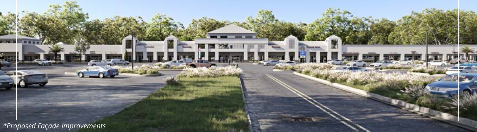
*Proposed Façade Improvements