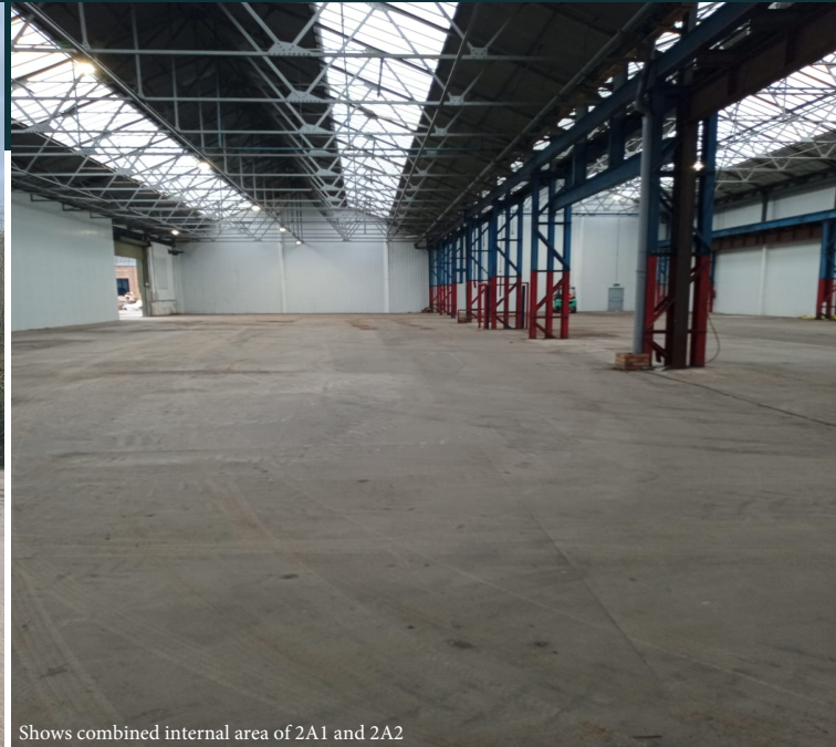
Shows combined internal area of 2A1 and 2A2

Historic industrial site re-invented for modern requirements. The site comprises industrial and office buildings.