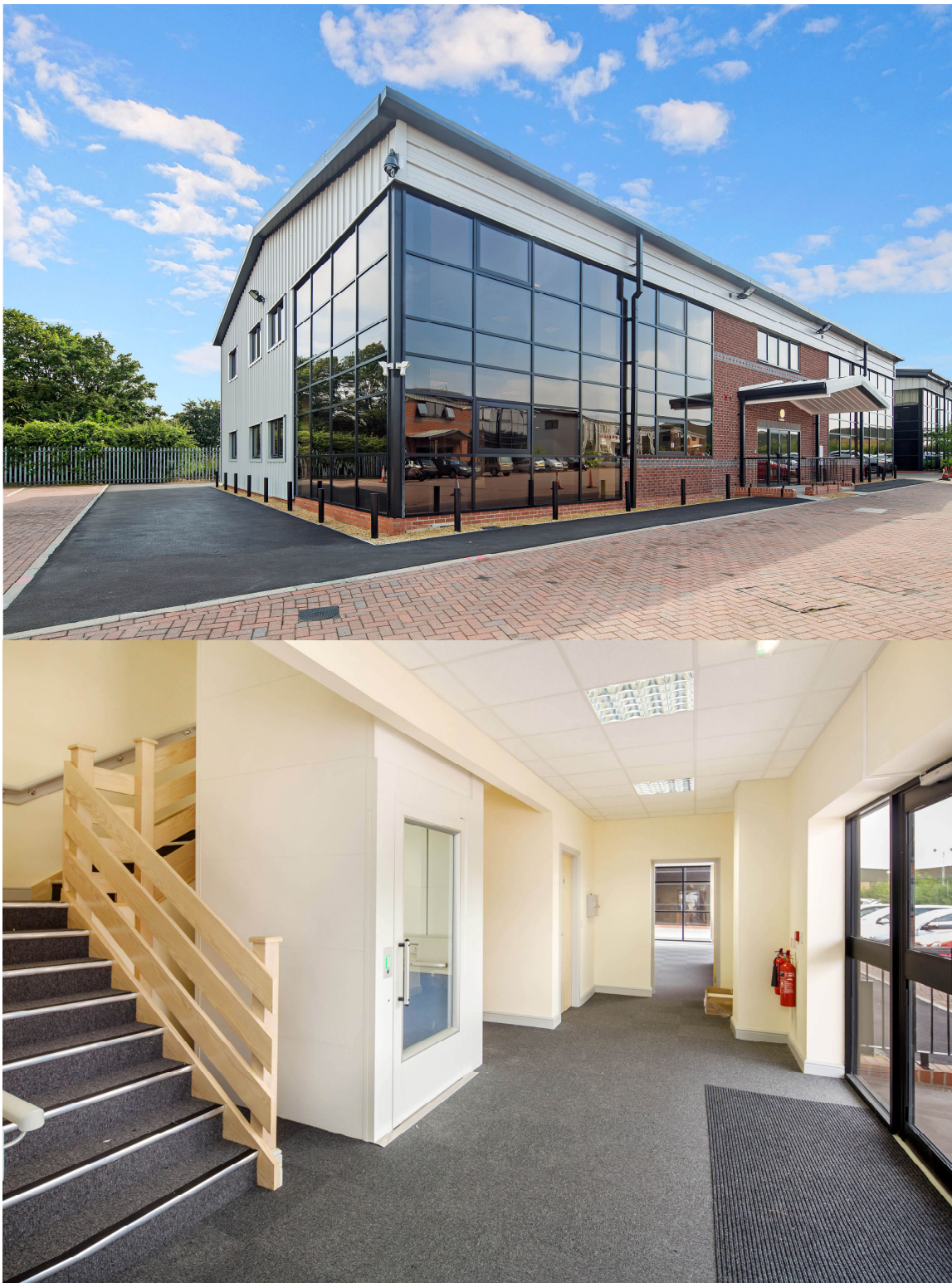
Stills of recently completed Jubilee House, which is similar.

Poyntons Consultancy 24, 26, 28 South Street, Boston, Lincolnshire PE21 6HT Tel 01205 361694 | Fax 01205 760218