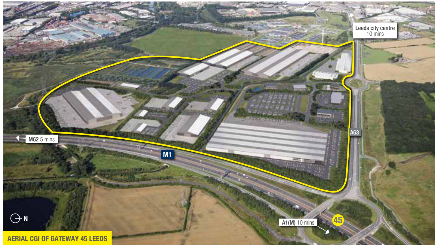
AERIAL CGI OF GATEWAY 45 LEEDS

The site also benefits from Central Government Enterprise Zone status, offering a range of incentives to occupiers.