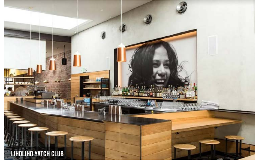
LIHOLIHO YATCH CLUB