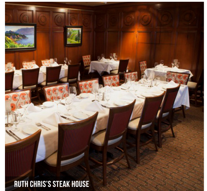
RUTH CHRIS'S STEAK HOUSE