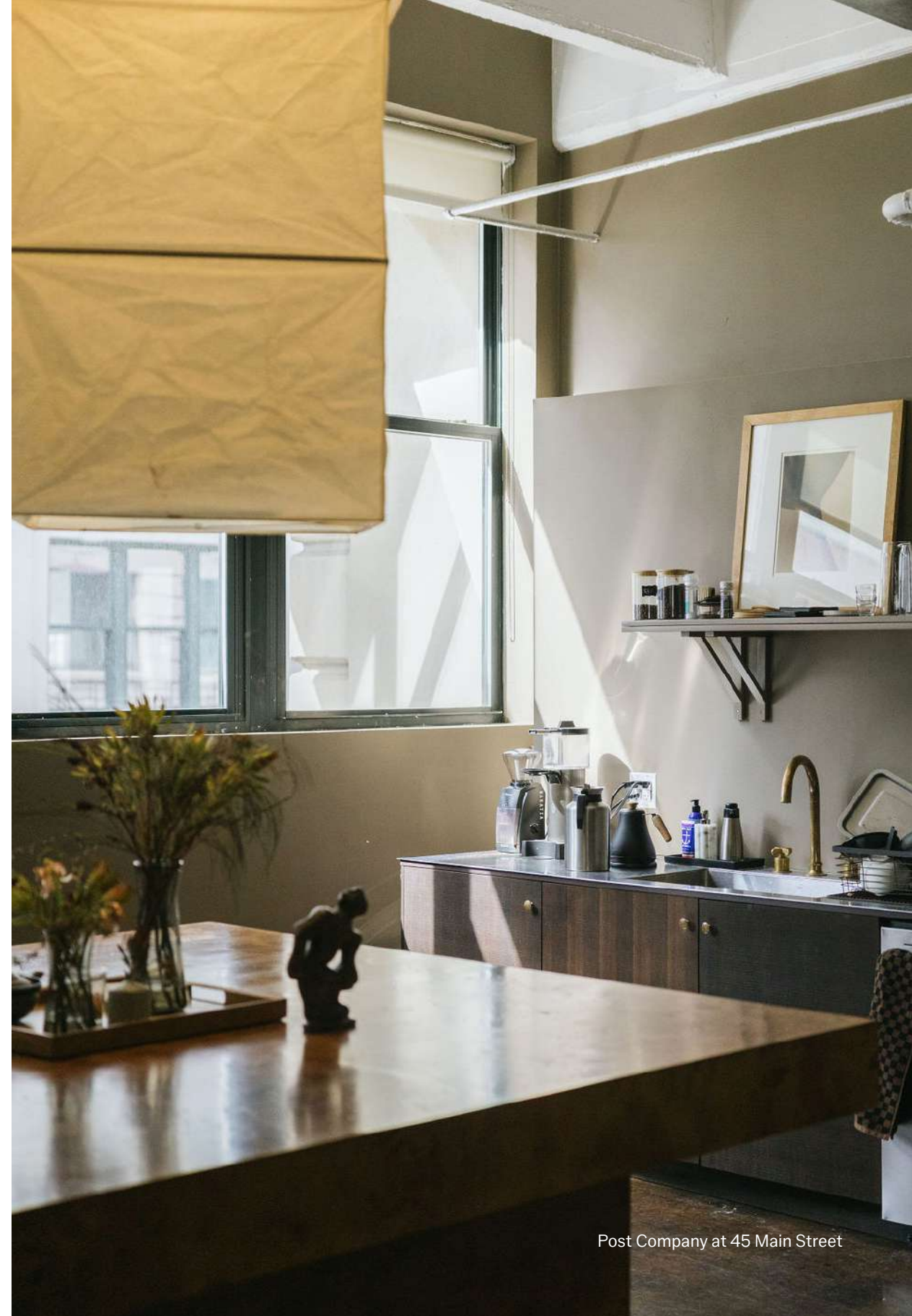
Post Company at 45 Main Street