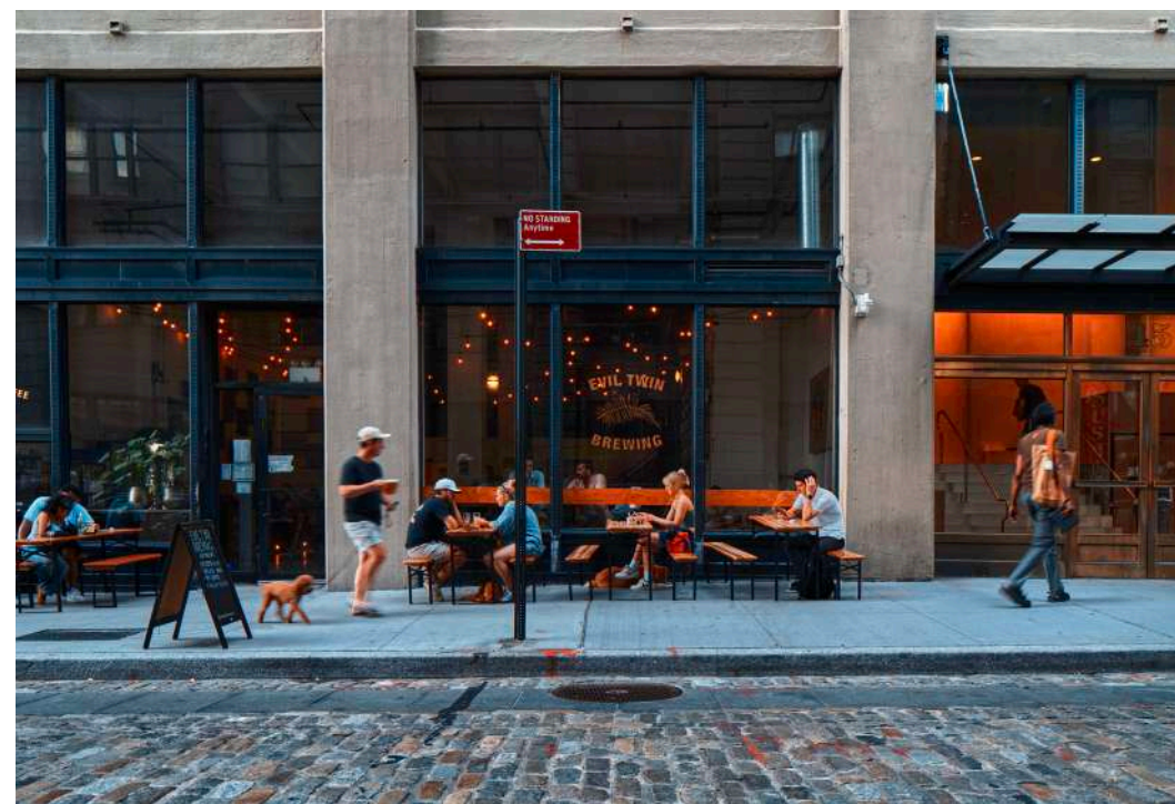
Evil Twin Brewing