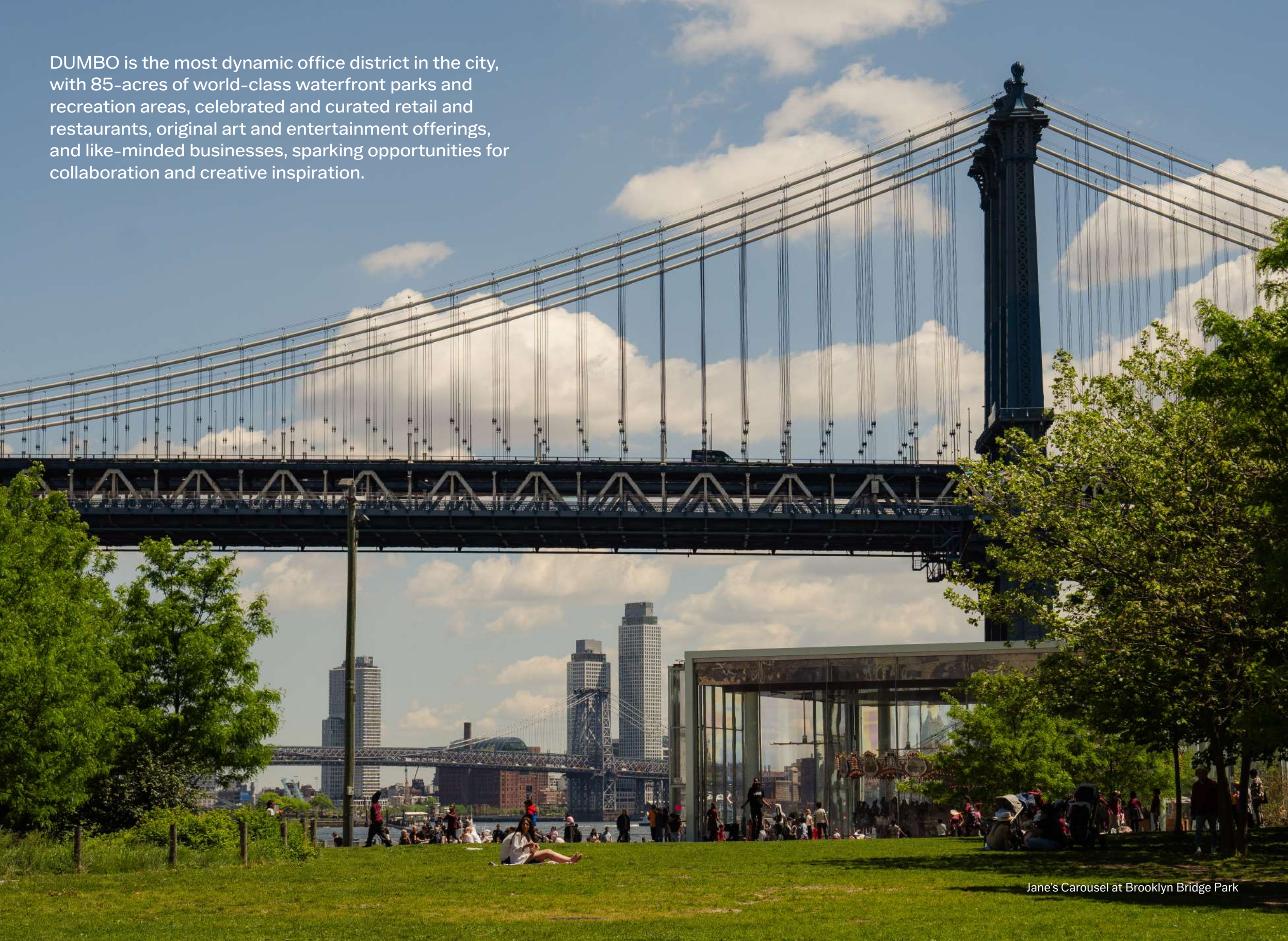
Jane's Carousel at Brooklyn Bridge Park

DUMBO is the most dynamic office district in the city, with 85-acres of world-class waterfront parks and recreation areas, celebrated and curated retail and restaurants, original art and entertainment offerings, and like-minded businesses, sparking opportunities for collaboration and creative inspiration.