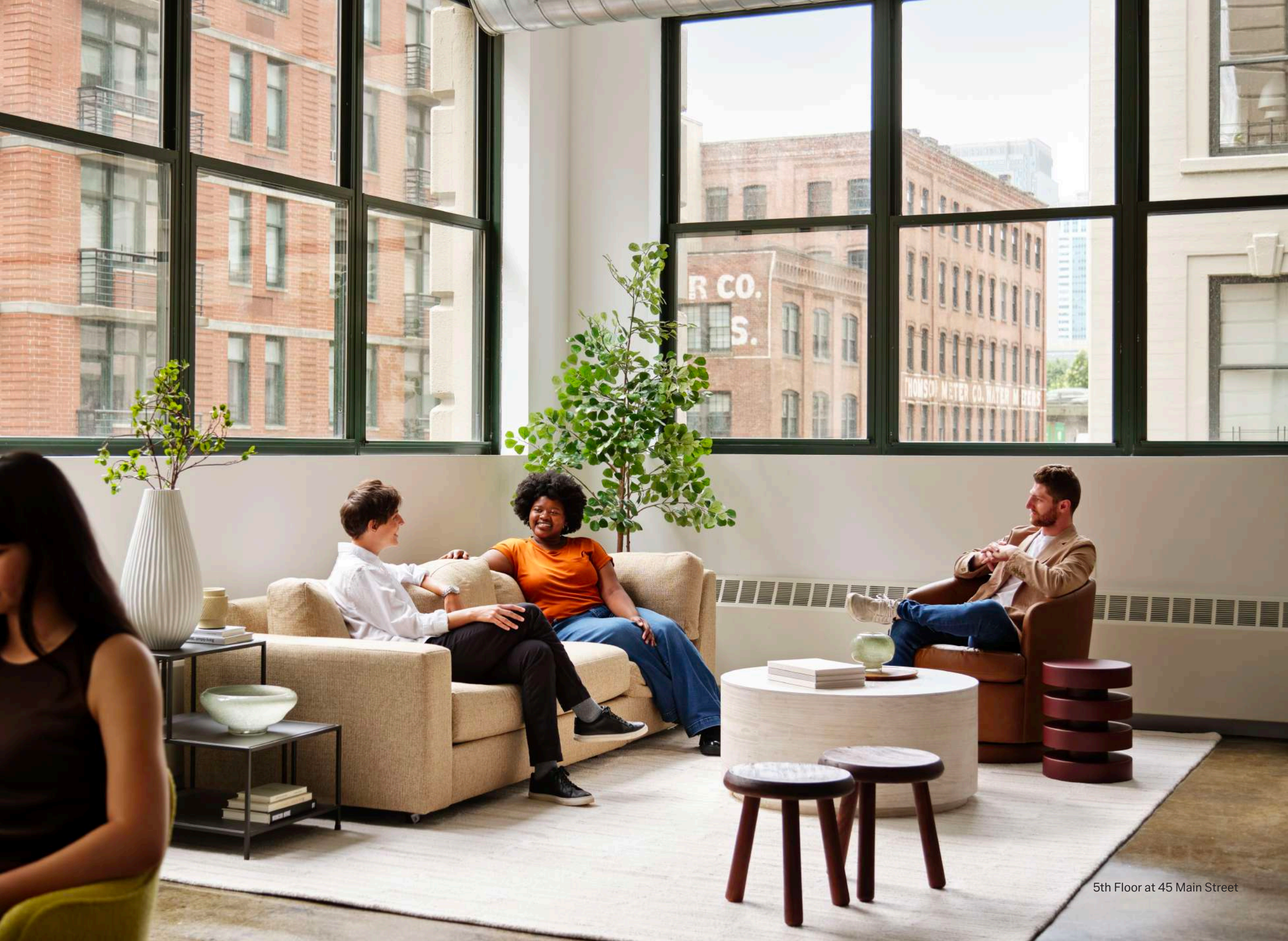
5th Floor at 45 Main Street