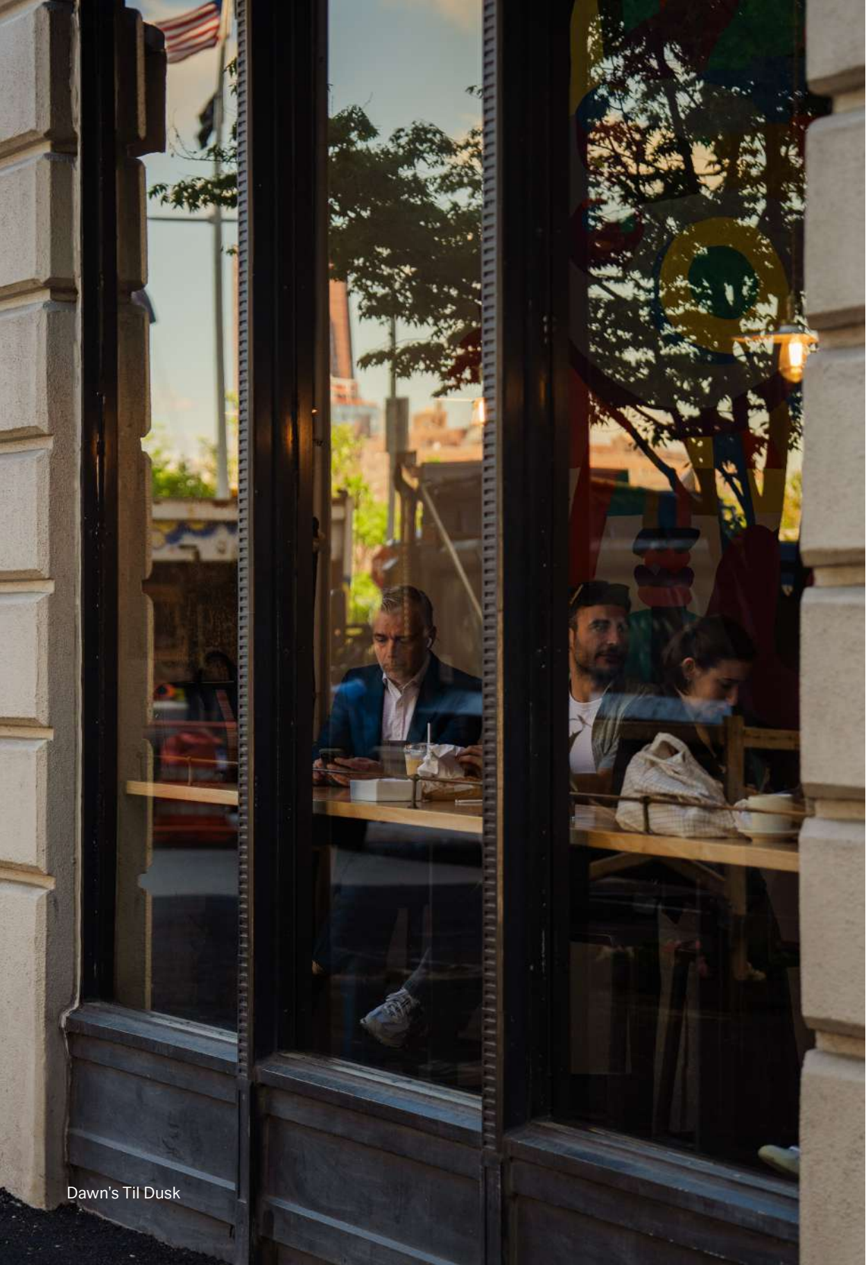
Dawn's Til Dusk