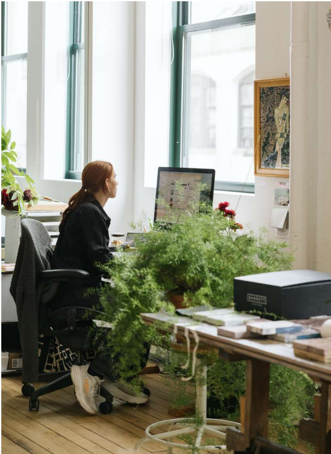
JAM Architecture at 20 Jay Street