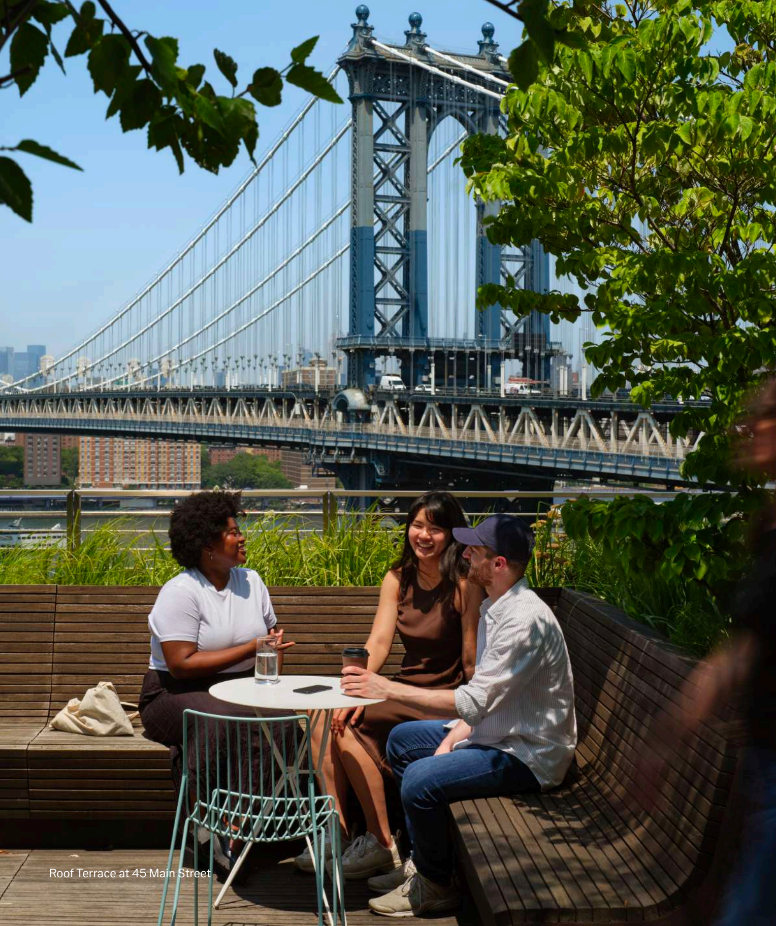
Roof Terrace at 45 Main Street