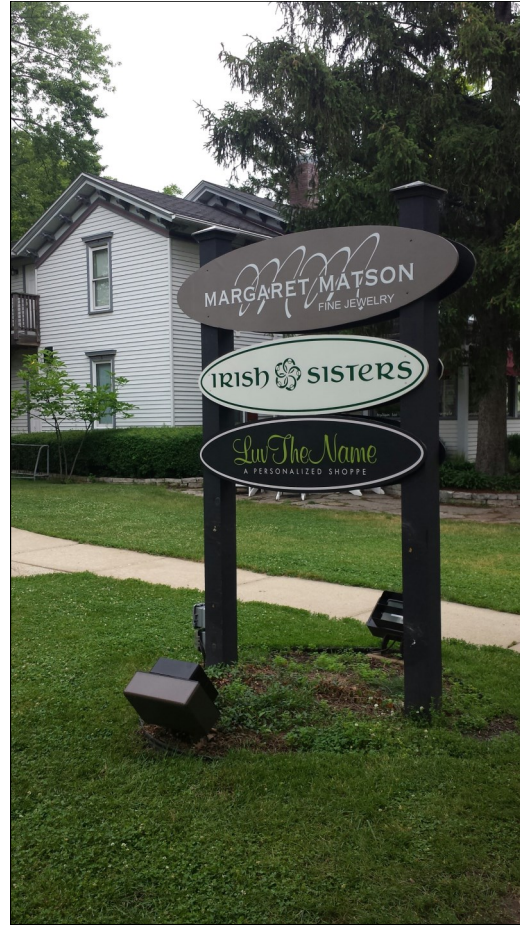
Charming 2nd Floor Office Space with 2 rooms and shared restroom